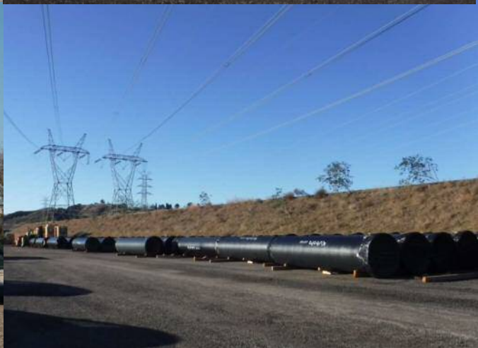
LAX pipe yard and Sylmar pipe yard

For further inquiry, please feel free to contact us. Kubota Corporation, Pipe Systems Global Marketing & Sales Department Address : 1-3, Kyobashi 2-chome, Chuo-ku, Tokyo, 104-8307 Japan E-mail : kbt_g.ironpipe@kubota.com Web site: https://www.kubota.com