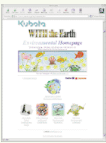
Kubota Environment home page

http://www.kubota.co.jp/eng/welcome.html