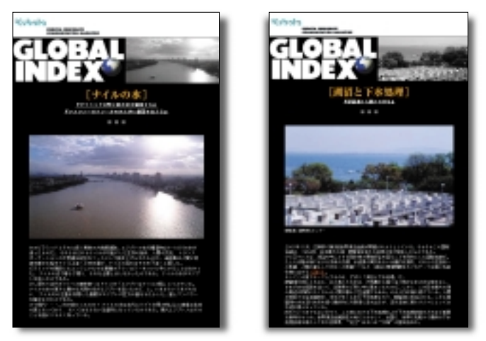
Global Index http://giweb.kubota.co.jp/

"Global Index" was named after the index of Kubota' s various businesses, which contribute to society extensively.