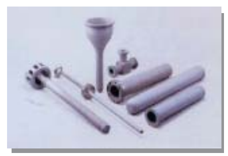
A various kind of ceramics products (ladle and stoke)