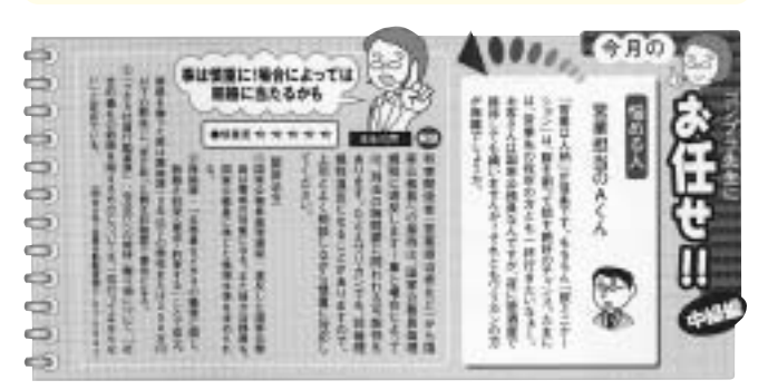
The article Let us ask Ms. Compliance appears in our in-house magazine monthly.

We have set up the "Kubota Hot Line" as a personal contact line for report and consultation from the employees of Kubota Group in order to offer more ease of access, instead of the previously established "consultation corner on business ethics", and been receiving any problem or concerns related to compliance with laws and business ethics, and been offering the solution and advice to them.