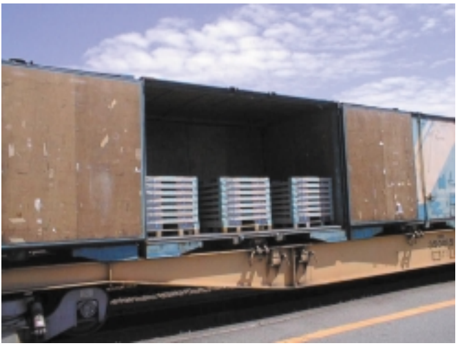
Shipments equal to 500 10-metric tons trucks are being transferred to freight shipping routes every month (Odawara plant)

We reduced 1,097 metric tons of CO_2 emission, by the reduction of wastes in the improvement of distribution system, and packing and crating system. The reduction of costs totaled to 867 million yen, increased by 55% over the previous year.