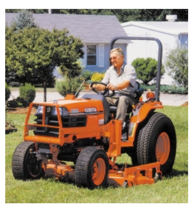
Small-sized tractor B2710