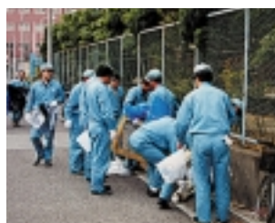
Sakai plant (in cleaning)

We at Kubota are involved in the local environmental activities such as cleaning and grass-cutting of rivers, roads and parks near our plants, cooperating with local people.