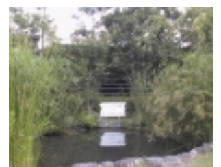
Dragonfly pond in Mukogawa plant