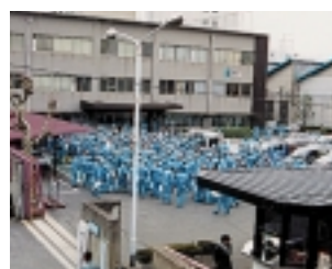
Sakai plant (preparation for cleaning)