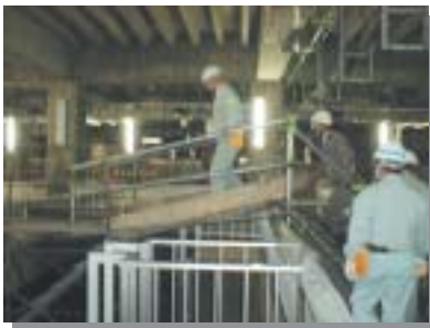
A guidance scene of safety and sanitation patrol in a construction site

From the point of view of "making structure, and training humans", we conduct the establishment and application of design standards, education and training, safety and sanitation patrol at the construction sites, and so on. In this way, we are trying to wipe out accidents, fortifying management function of the branches and the thorough controlling management of construction sites by the division concerned.