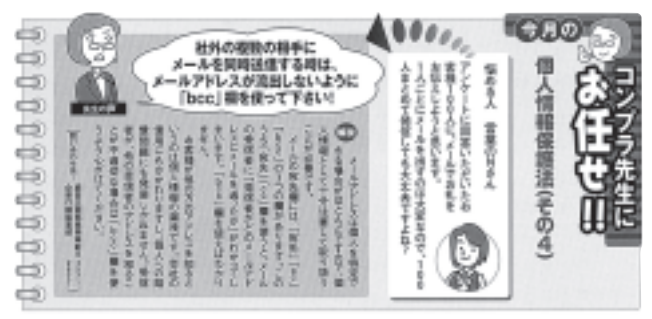
Article from the company journal

Compliance education is also provided to applicable personnel in the event of executive training programs or by-rank workshops. In 2004, an ecompliance learning program was started for all employees.