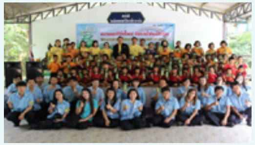
A group photograph with the elementary school students

KET will continue to run education activities at the elementary school, aiming to communicate with the local community while contributing to local environmental conservation activities.