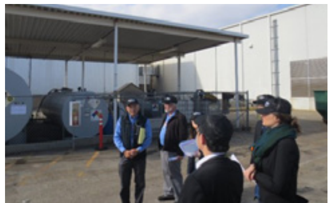
Kubota Industrial Equipment Corporation (US)