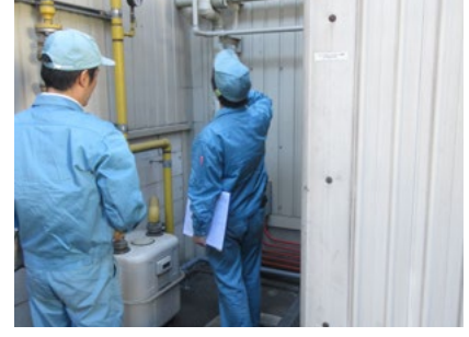
Environmental risk assessment Kubota Tsukuba Plant

The Kubota Group is proactively working to further reduce environmental risks by conducting environmental audits and environmental risk assessments—two activities with differing perspectives—in parallel.