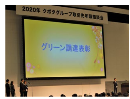
FY2019 Awarding ceremony (January 2020) * Due to the COVID-19 pandemic, the awarding ceremony was not held in FY2020.

We started expanding this system globally in 2018, and presented awards at overseas sites as well. We will continue to utilize the system and carry out activities in the name of green procurement and promote environmental conservation initiatives hand-in-hand with our suppliers.