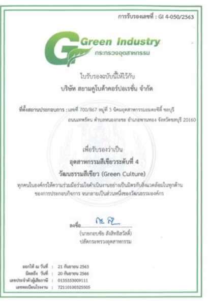
Green Industry Award certificate

The award has a three-year certification period, and KUBOTA Precision Machinery (Thailand) Co., Ltd. has previously received a Level 3 award, and KUBOTA Engine (Thailand) Co., Ltd. a Level 4 award. They are still currently recognized as Green Industries.