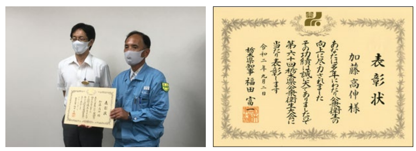
The certificate of commendation from the prefectural governor at the Tochigi Prefecture Public Health Competition and the award ceremony