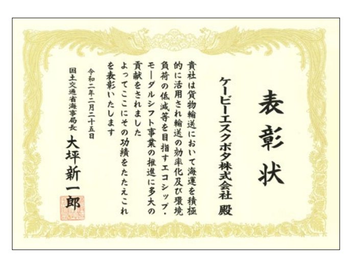
Commendation certificate of the "Director-General Commendation of the Maritime Bureau, Ministry of Land, Infrastructure, Transport and Tourism"