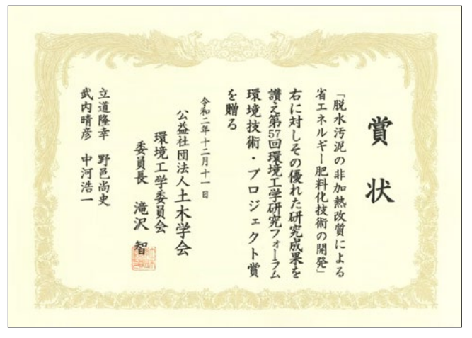
Environmental Technology and Project Award certificate

The award is presented to the most outstanding technology among those presented at the Environmental Engineering Forum. This is the third consecutive year that Kubota has received the award. The technology proposes a new energy-saving system for a different approach from the conventional drying technology to dewater sewage sludge and convert it into fertilizer. It was highly evaluated from its low lifecycle cost.