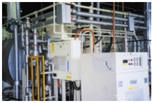
Alternative washing machine (Tsukuba plant)