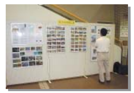
Keiyo plant (participation in the environmental fair of the city of Funabashi in June 2003)