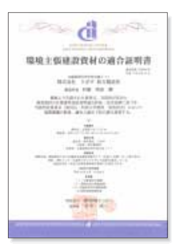
Certificate of compliance

The "Jusui" butterfly valve was examined by the Japan Testing Center for Construction Materials Determination Committee, its environmental claim conformance was evaluated as being equivalent to the L2 class in the "Environmental Claim Conformance Evaluation Guide for Construction Materials" (fiscal 2003 version), its function as satisfying the JWWA B138 "Water Service Butterfly Valves" standard, its water supply stability as meeting the specified quality control system, and a certificate of compliance for "Environmental Claim Conformance is studied.