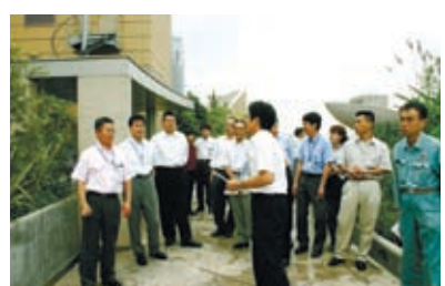
Tour of a company with an advanced environmental policy